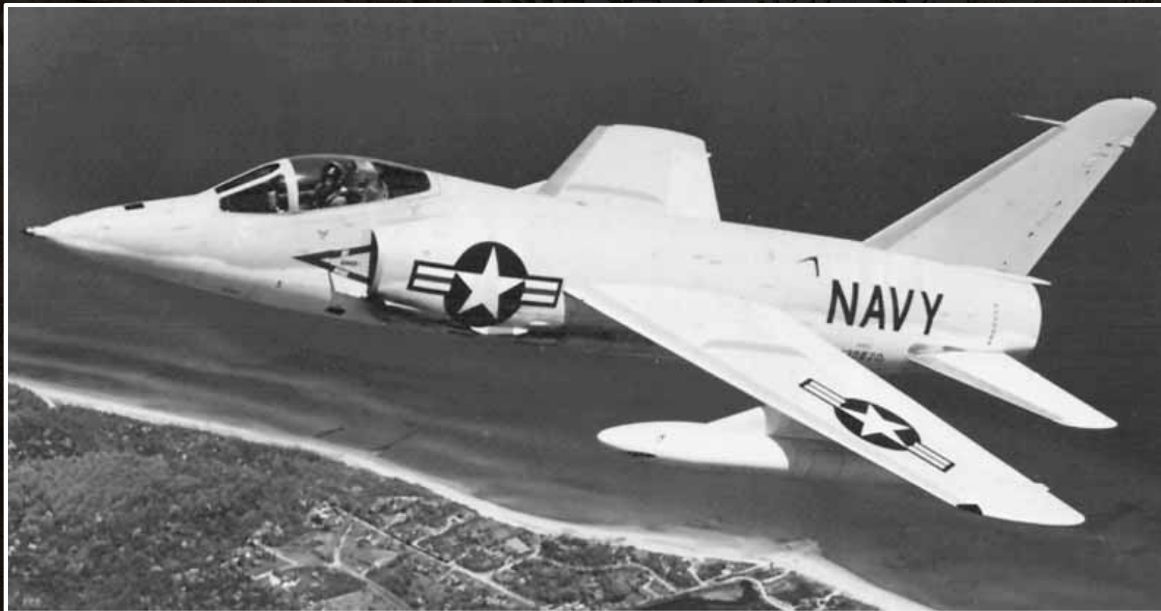
Tommy Attridge in Navy Grumman F11F-1 Tiger