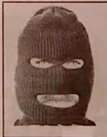
This is a sketch of one of the men suspected of robbing a convenience store last week.

The men forced a clerk, who was working alone, into a cooler. She