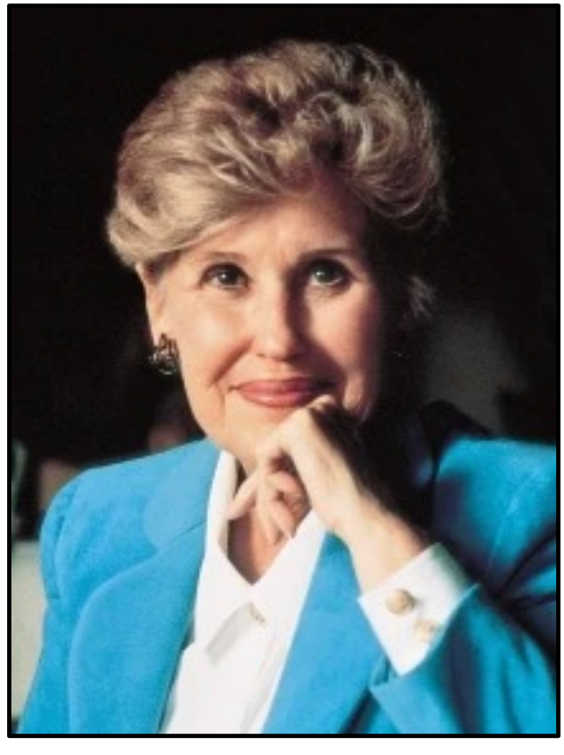
Erma Bombeck 1927–1996