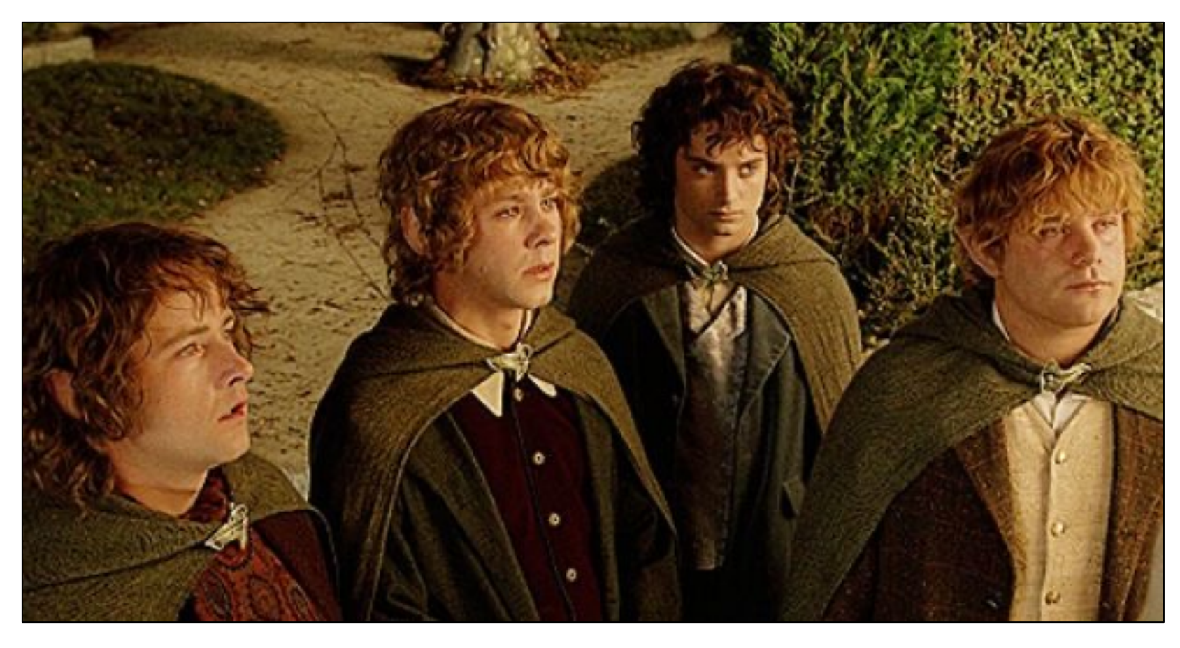
Pippin, Merry, Frodo, and Sam