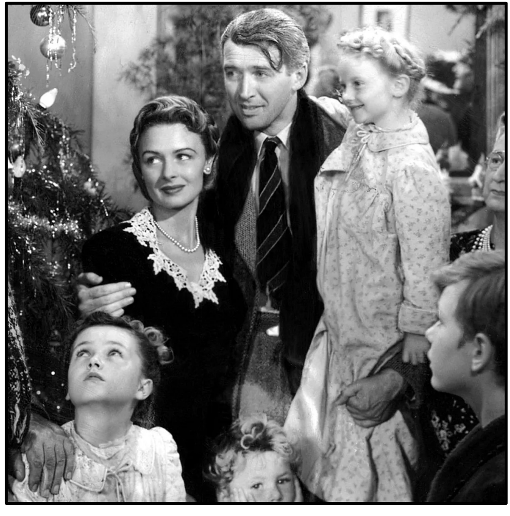
"It's a Wonderful Life" 1947