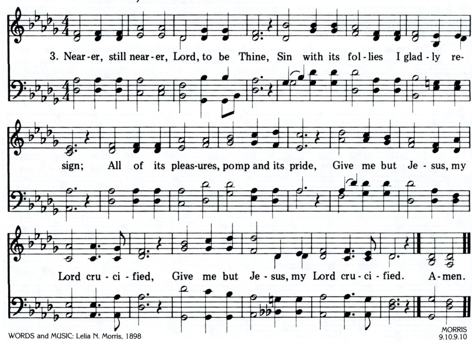
For use solely with the Song Select Terms of Use. All rights Reserved. www.ccli.com CLI License No. 21229380