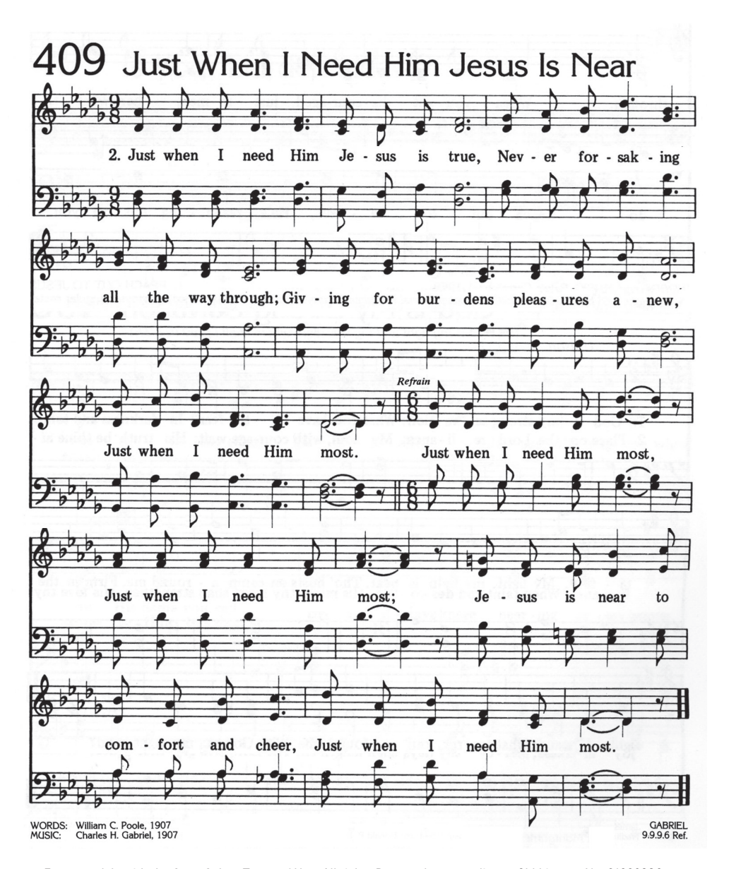
For use solely with the Song Select Terms of Use. All rights Reserved. www.ccli.com CLI License No. 21229380