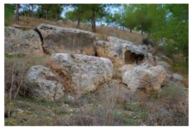
"...bowed down in distress." (Psalm 57:6)